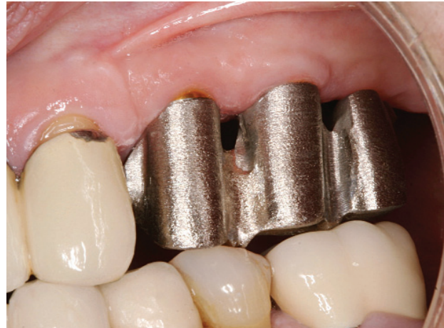
Figure 3. Intraoral left lateral view of metal assemblage of an implant-supported cantilevered fixed dental prosthesis. The interproximal connectors are larger than usual to provide additional strength for the cantilevered prosthesis (6-millimeter height and 4-mm buccopalatal width). The size of the casting’s embrasure can be modified before porcelain application depending on the type of interproximal cleansing technique that the clinician will recommend (such as an interdental brush or a floss threader). This prosthesis rests on implants that are 4.1 mm in diameter and internally connected.

Mesiodistal length of the cantilever. The length of a cantilever usually is computed on the basis of the supporting implants’ anteroposterior spread—the distance between parallel lines drawn through the most anterior and most posterior implants. The anteroposterior spread can be affected by several factors: number and length of implants supporting the prosthesis, presence of cross-arch stabilization and masticatory forces generated by the patient (such as parafunctional forces). At present, there is no consensus as to the optimal cantilever length as a function of